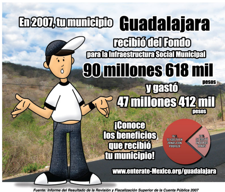
Figure 2: Example of flyers for the two placebo groups

Notes: The flyer was folded in half. The front of the flyer is the same as the upper image in Figure 1 for all flyers. In the “Budget Information” group the inside of the flyer was as shown in the upper image in this figure. In the “Poverty expenditure” group the inside of the flyer was as shown in the lower image.